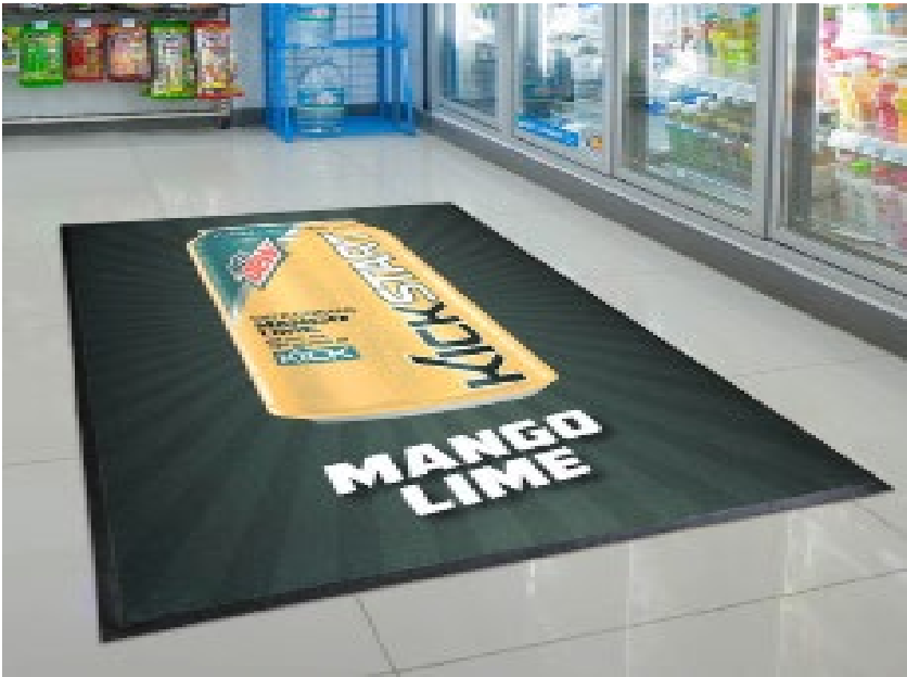
Photo quality image Highly cost effective Promotional medium Standard & Custom sizes available. Bespoke sizes available Anti-slip rubber backing Slimline stay-flat construction